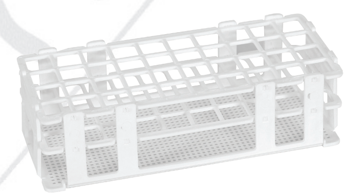
Syringe Rack (autoclavable) Available 10cc, 35cc, 60cc