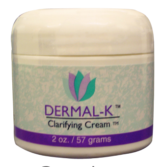
2 oz. jar

The use of Vitamin K injections to treat bleeding problems is well documented and now the same benefits are available in the form of an all natural topical cream. Used pre-operatively, twice a day, for seven days, Dermal-K has been shown to effectively reduce post-op bruising.